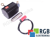
SP2-12 TE CONNECTIVITY

New TE CONNECTIVITY SP2-12 Tested and cleaned. 12 months guarantee Dedicated courier Delivery across Europe even in 2-3 working days